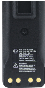
NNTN8570 IMPRES 1250 mAh typical Li-Ion Battery

IMPRES batteries when used with an IMPRES charger, provide automatic and adaptive charging, end-of-life display and other advanced features.