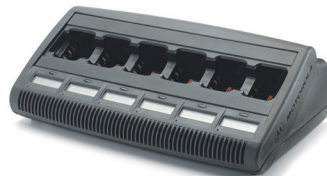
WPLN4220 IMPRES Multi-Unit Charger with 6 displays and Euro plug. 100-240 VAC