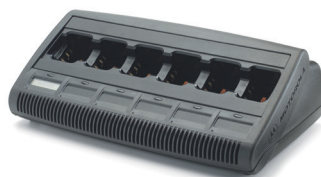
WPLN4213 IMPRES Multi-Unit Charger with 1 display and Euro plug. 100-240 VAC