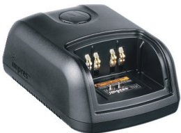
WPLN4254 IMPRES Single Unit Charger – UK, 220-240 VAC

IMPRES Single Unit Chargers are ideal for personal use. Charge your radio or 1 spare battery.