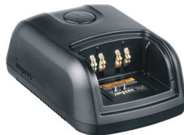
WPLN4255 IMPRES Single Unit Charger – Euro, 220-240 VAC