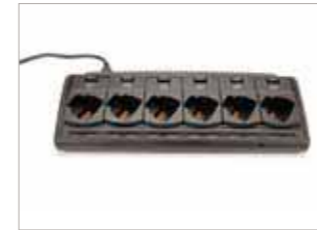
NNTN6904 Multi-unit charger that charges up to 6 radios simultaneously (US plug).