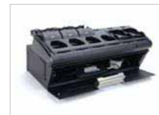
NNTN7560 Optional base with storage tray for programming cables.