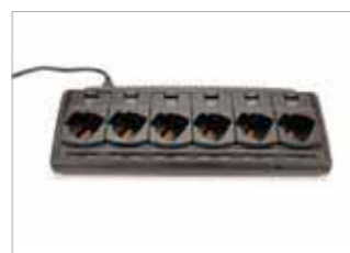
NNTN6901 Multi-unit charger that charges up to 6 radios simultaneously (UK plug).