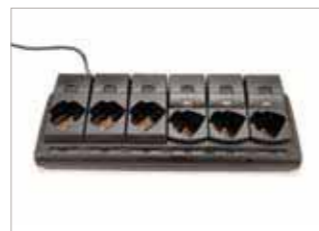
NNTN7724 iTM (Integrated Terminal Management) multi-unit charger that charges up to 6 radios simultaneously. Order programming cable SKN6371 separately. (EU plug).