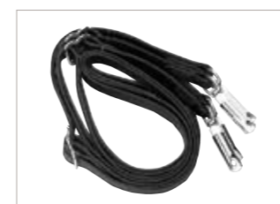
NTN5243 Adjustable carry case shoulder strap in black Nylon for cases with rings.

KEEP YOUR RADIO SAFE AND SECURE IN TOUGH ENVIRONMENTS.