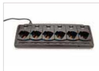
NNTN6900 Multi-unit charger that charges up to 6 radios simultaneously (EU plug).