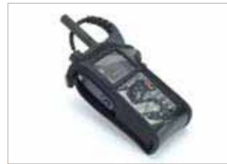
PMLN5828 Peter Jones (ILG) Klick Fast soft leather case without dock - attaches to shoulder wearing device with Peter Jones (ILG) Klick Fast stud (PMLN5004).