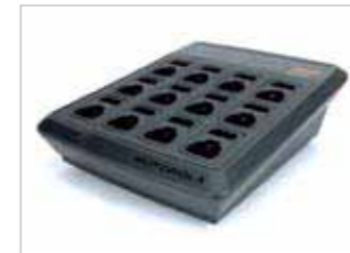
NNTN7961 Multi-unit charger with 12 radio and 12 battery pockets with EU plug - charges radios first, then batteries.