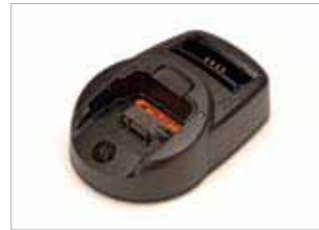
FTN6575 Dual pocket desktop charger base that charges radio and battery sequentially. Requires personal charger power supply.