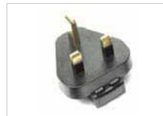
SYN7455 UK plug adapter for personal charger.