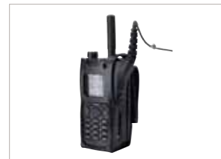
PMLN5572 Rugged leather carry case with 3" belt loop provides ultimate protection wherever you go.