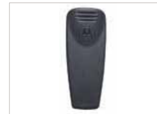
PMLN5616 2" plastic spring belt clip.