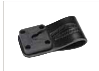
GMDN0445AC Peter Jones (ILG) Klick Fast leather belt loop with mounting dock (50 mm) - attaches to shoulder wearing device with Peter Jones (ILG) Klick Fast stud (PMLN5004).