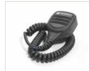
PMMN4040 Small submersible windporting remote speaker microphone with IP57 rating.