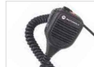
PMMN4085 Large windporting remote speaker microphone with volume control, emergency button, one programmable button, 3.5mm audio jack and IP55 rating.