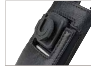
PMLN5004 Shoulder wearing device with Peter Jones (ILG) Klick Fast stud.