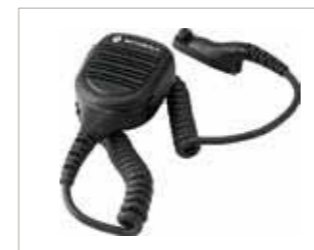
PMMN4050 Small noise-cancelling remote speaker microphone with 3.5mm audio jack and IP54 rating.