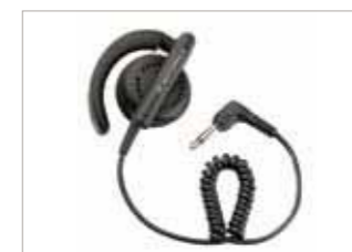
WADN4190 Over the ear receiver for remote speaker microphones with a 3.5mm jack - comfortable, hygienic secondary audio accessory.

BOOST AUDIO PERFORMANCE WITH HIGH PERFORMING REMOTE SPEAKER MICROPHONES THAT FEATURE WINDPORTING OR NOISE-CANCELING TECHNOLOGY TO IMPROVE PERFORMANCE IN WINDY OR HIGH NOISE ENVIRONMENTS.