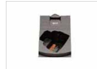
NNTN6845 Interchangeable radio pocket insert for use with 6-pocket multi-unit charger.