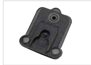
GMDN0547 Peter Jones (ILG) Klick Fast double tongue tag dock - attaches to shoulder-wearing device with Peter Jones (ILG) Klick Fast stud (PMLN5004).