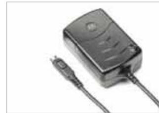
NNTN7558 Personal charger power supply with US plug - requires SYN7456 for Europe or SYN7455 for UK.