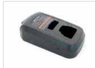
NNTN8241 Dual pocket desktop charger that charges radio and battery simultaneously. Requires personal charger power supply.