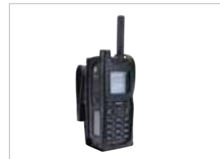
PMLN5571 Soft leather carry case with 3" belt loop, flexible, comfortable case to protect your radio on the move.