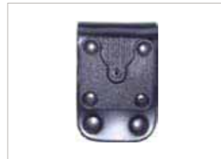
GMDN0566AC Peter Jones (ILG) Klick Fast leather belt loop and docks up to 50mm in width - attaches to shoulder-wearing device with Peter Jones (ILG) Klick Fast stud (PMLN5004).