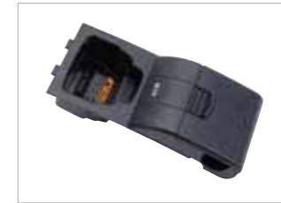
NNTN6848 Interchangeable single iTM (Integrated Terminal Management) radio pocket insert with USB port for charging and programming.