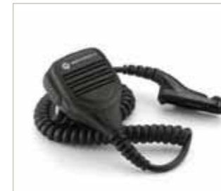
PMMN4025 Small windporting remote speaker microphone with 3.5mm audio jack, emergency button and IP54 rating