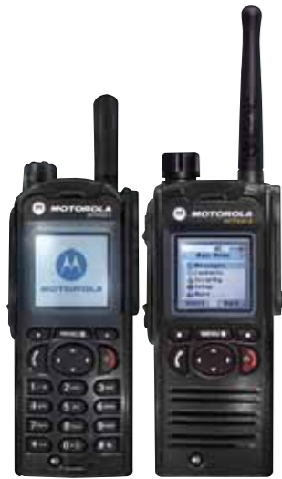
MTP850 S/ MTP830 S