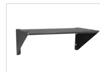
NNTN6844 Wall mount bracket for multi-unit charger - keeps your charger in a single, safe location.

YOUR RADIO IS YOUR MOST IMPORTANT PIECE OF EQUIPMENT SO MAKE SURE YOU'RE ALWAYS POWERED UP FOR YOUR NEXT MISSION.