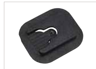
GMDN0386 Peter Jones (ILG) Klick Fast sew-on dock for mounting radio on uniforms, body armour and other clothing - attaches to shoulder wearing device with Peter Jones (ILG) Klick Fast stud PMLN5004.