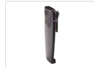
HLN9714 2.5" spring belt clip.