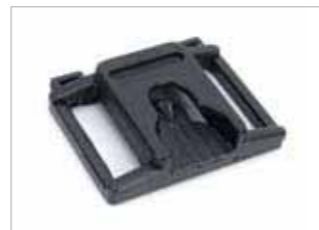
PMLN5829 Peter Jones (ILG) Klick Fast belt dock for mounting through belts up to 32mm in width - attaches to shoulder wearing device with Peter Jones (ILG) Klick Fast stud (PMLN5004).