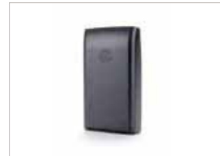
PMNN4351 Boost power using this lithium-ion battery with 1850 mAh capacity.