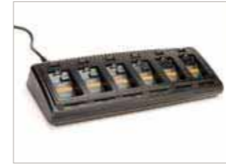
NNTN6911 Multi-unit charger with 6 battery pockets and US plug.