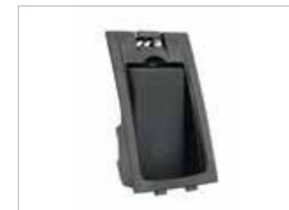
NNTN6846 Interchangeable battery pocket insert for use with 6-pocket multi-unit charger.