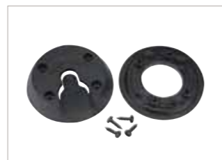
WALN4307 Peter Jones (ILG) Klick Fast retro fitting garment with easy screw-to-fit dock - attaches to shoulder-wearing device with Peter Jones (ILG) Klick Fast stud (PMLN5004).