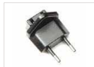
SYN7456 EU plug adapter for personal charger.