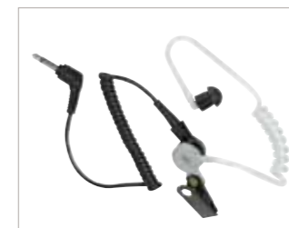
MDRLN4941 Receive only earpiece with translucent tube and eartip for remote speaker microphones - secure and discreet secondary audio accessory.