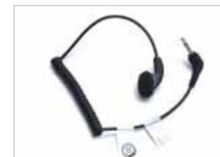
MDRLN4885 Receive only earbud for remote speaker microphones with a 3.5mm jack - comfortable, cost-effective secondary audio accessory.