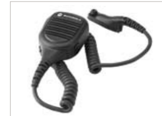
PMMN4062 Large noise-cancelling remote speaker microphone with extra loud speaker, 3.5 mm audio jack, emergency button and IP54 rating.