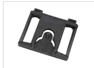
GMDN0497 Peter Jones (ILG) Klick Fast belt dock for mounting through belts up to 38mm in width - attaches to shoulder-wearing device with Peter Jones (ILG) Klick Fast stud (PMLN5004).