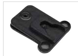
GMDN0445AA Peter Jones (ILG) Klick Fast snap on tag dock - attaches to shoulder wearing device with Peter Jones (ILG) Klick Fast stud PMLN5004.