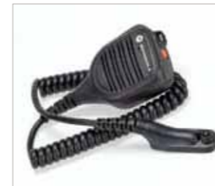
PMMN4046 Large submersible windporting remote speaker microphone with volume control, emergency button, one programmable button and IP57 rating.