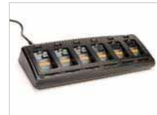
NNTN6907 Multi-unit charger with 6 battery pockets and UK plug.